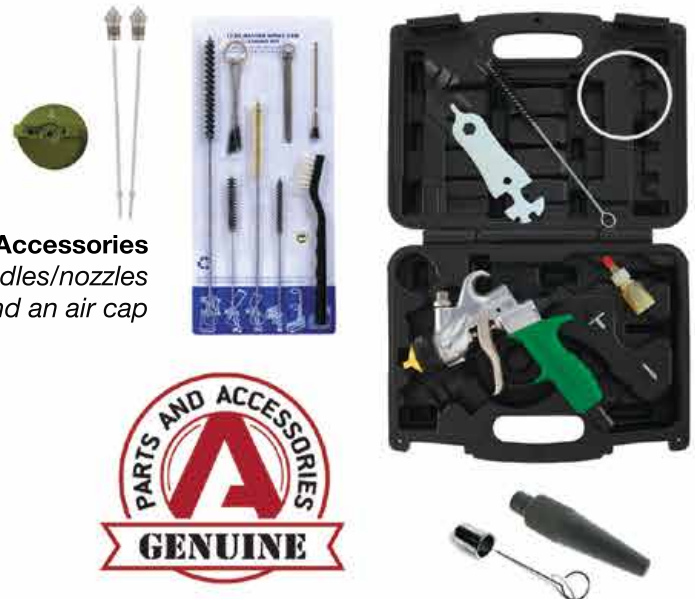
PLUS Accessories Two needles/nozzles and an air cap

Deluxe Spray Gun Case, Wrench (Spanner), Gun Lube, Cleaning Kit, Viscosity Cup & Blow Off Tool.