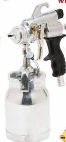
E7000 Non-Bleeder with Bottom Cup