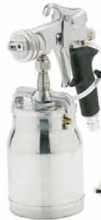
E5011 Bleeder with Bottom Cup