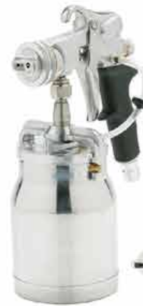
E5011 Bleeder with Bottom Cup