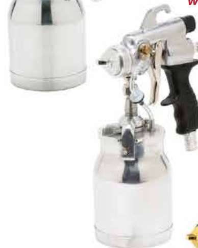
E7000 Non-Bleeder with Bottom Cup