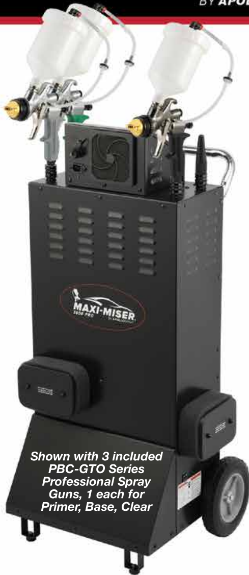
Shown with 3 included PBC-GTO Series Professional Spray Guns, 1 each for Primer, Base, Clear