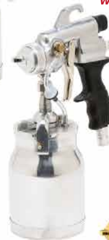
E7000 Non-Bleeder with Bottom Cup