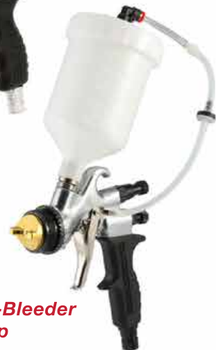
E7700GTO Non-Bleeder with Gravity Cup